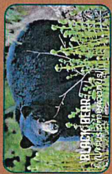
BLACK BEAR (Ursus americanus)

GUESS THE TRACKS scan the QR code to find out