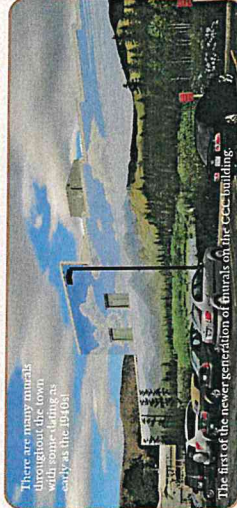
There are many murals in town with some dating as far back as the 1940s. The first of the newer generation of murals are currently in the process of being painted.