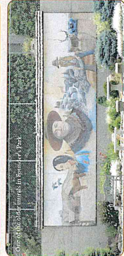
One of the older murals in town depicts a scene from the early days of the town.